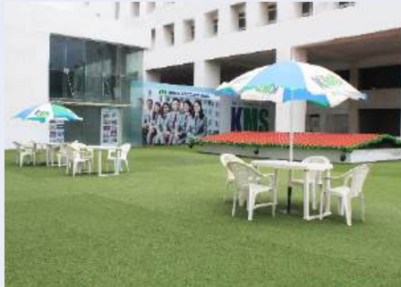
The KMS Lawn