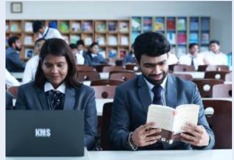
Learning Resource Center