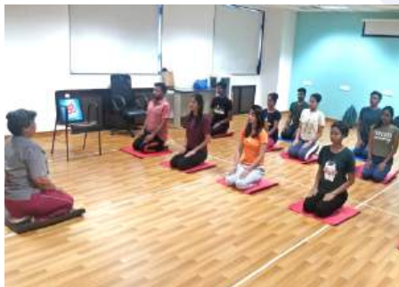
Yoga Room & Cultural Centre