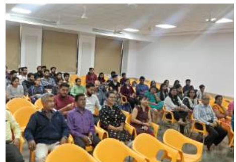
Well-equipped Seminar Room