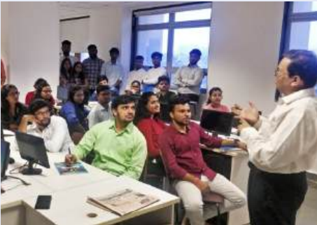
Mock Stock Room

While studies are of paramount importance on the campus, the adage 'all work and no play makes Jack a dull boy' prompted us to provide facilities, other than for studies, while planning the campus. Our infrastructure facilities go a long way in developing the overall growth of our future corporate honchos. The facilities provided are: