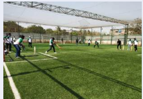
KET Turf Park